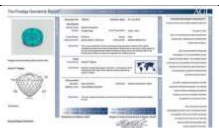
Noor Gems Japan Ltd's 61.80-carat Paraiba tourmaline comes with a gemstone report

With a proven track record spanning more than 40 years, Noor Gems Japan Co Ltd has carved out its own niche as a supplier of the finest and rarest Paraiba tourmalines, Kashmir sapphires, alexandrites, rubies, emeralds and more.