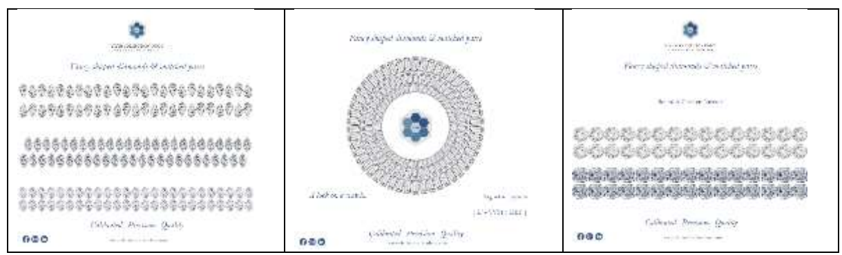
Precisely cut diamonds in calibrated sizes from Vivid Collection DMCC

Buyers looking for calibrated diamonds – from pairs and layouts to rows upon rows of matching stones – are encouraged to visit Vivid Collection DMCC at the fair. A manufacturer of "Thai Cut Diamonds," the supplier offers stones in rounds and virtually all fancy shapes, including emeralds, Asschers, baguettes, tapers, princess, marquise, pears and ovals, among others.