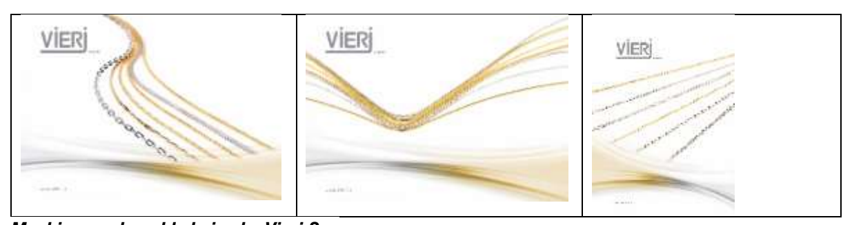
Machine-made gold chains by Vieri Spa